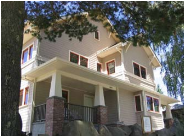
The Sensible House, image from www.sensiblehouse.org .