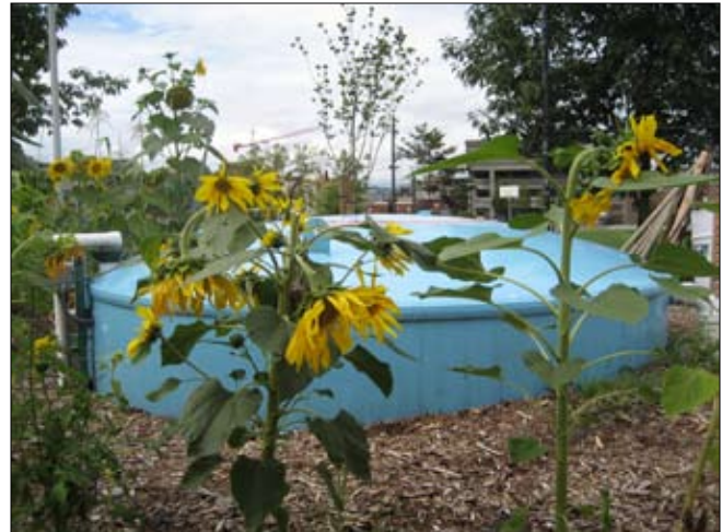
The Cascade People's Center uses rainwater collected from the roof and stores it in a cistern for toilet flushing.

Potable water is clean water — satisfactory for drinking, culinary and domestic purposes, and meets the drinking water standards established by the Washington State Department of Health.