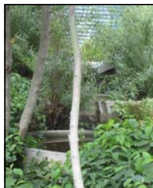
Top to bottom: Seattle cistern art, Beckoning Hand Scene, Rain Garden and Overflow, Vine Street, Seattle, Wash.