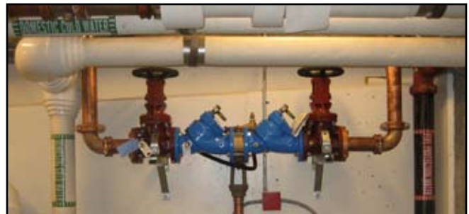
From top to bottom: Cistern inlets, pipe labels, potable water bypass, King Street Station, Seattle, Wash.