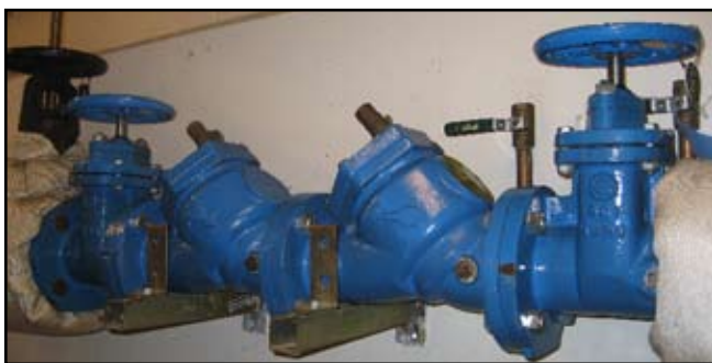
Pumps, filters and backflow prevention, King Street Station, Seattle, Wash.

date of May 15, 2000. This publication is divided into sections on waterless toilets, greywater systems and subsurface drip dispersal systems for greywater use in irrigation. This publication can be found at www.doh.wa.gov/ehp/ts/WW/Greywater-Fact.PDF .